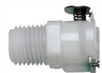
Typical shown: 1/4" NPT Male Pipe Thread with Shut-off Valve

These adapters are available with or without an integral shut-off valve. The shut-off valve will stop line flow when the adapter is removed from the unit. Flow resumes when connected.